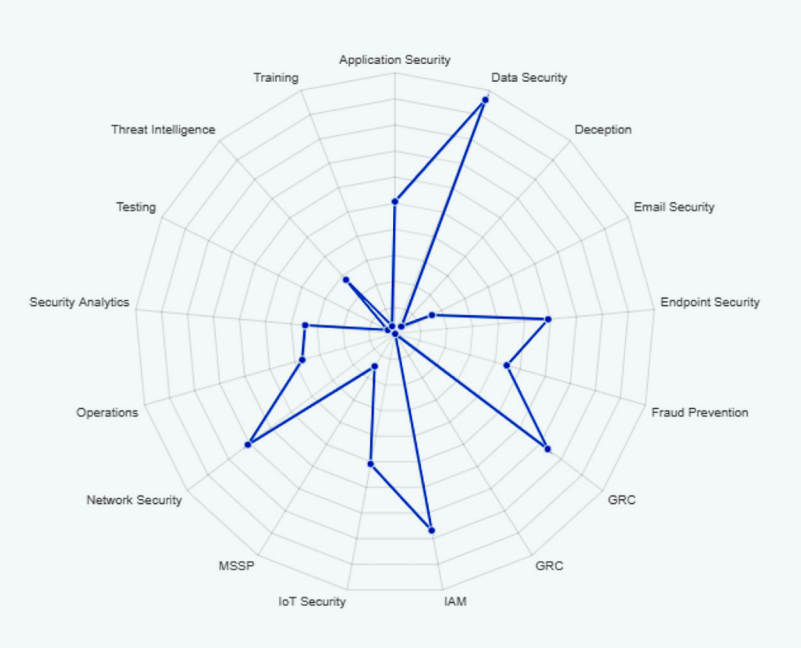
Figure 1: Global Cybersecurity investment by sector.

As can be seen from figure 1 above. Fraud prevention investment (which includes Bot Defense) receives less investor enthusiasm than Data Security, Network Security and is on a par with Application Security. So the merger of HUMAN Security and PerimeterX has the potential to significantly affect this market, not only on purely technical capabilities but also by creating a strong competitive player.