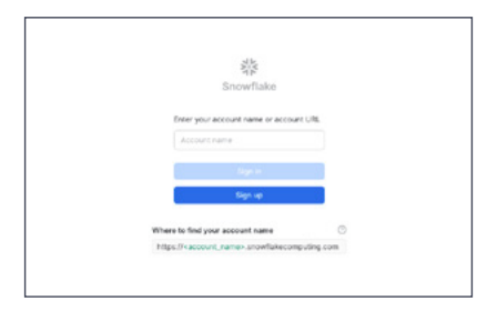
Log into your Snowflake UI as ACCOUNTADMIN