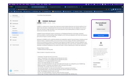
Request access to the datasets